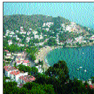
Puerto La Cruz