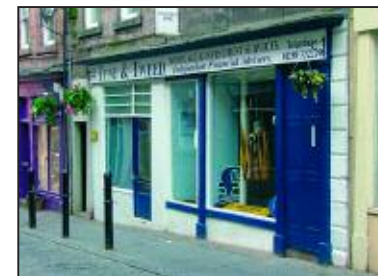
Tyne & Tweed, West Street