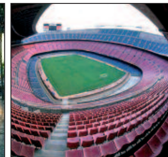
The Nou Camp