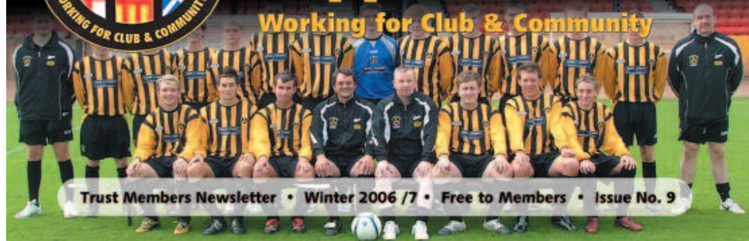
Trust Members Newsletter • Winter 2006 /7 • Free to Members • Issue No. 9