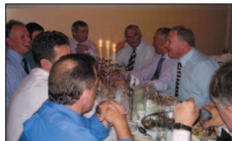
The 79 team enjoying the night