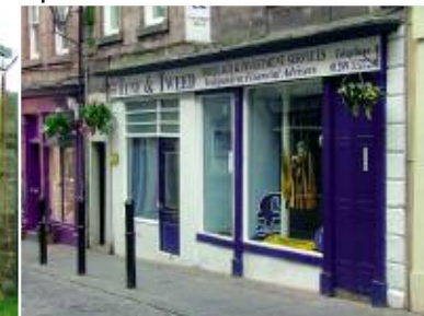
Left: Our Shop at Shielfield Park Above: Our Town Centre outlet at Tyne & Tweed, West Street

For those who don't know, the Club Shop dealing with merchandising, is run by the Supporter's Trust.