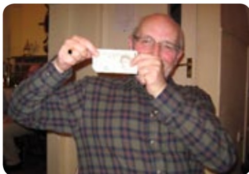
Our vice-chairman celebrates his only win of the night!

The next Trust event is the 70s disco on 12th December, and plans are already in hand for another race night at Berwick Holiday Centre. Thanks again to everyone for their support.