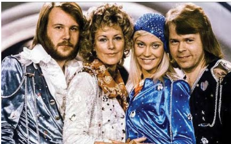
Is the Lowland League a Rich Man's World?