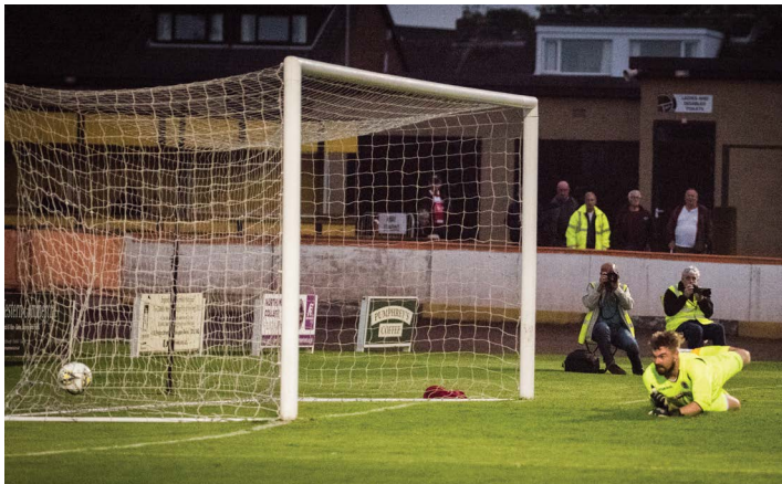
Our first ever Lowland League goal hits the net

through to a possible money spinning draw in the following rounds were slim and despite putting up a brave performance Rangers eventually lost 3-1. Thanks to their new found Lowland League status, Rangers now compete in the Football Nations Qualifying Cup and the South of Scotland Cup. Despite First round victories in both competitions against Spartans and Newtongrange Star, Rangers crashed out in the Second round of both tournaments. A 4-1 defeat away to a Kelty Hearts side brimming with players of SPFL pedigree was perhaps not surprising but a 2-1 defeat away to East of Scotland side Tranent was a real disappointment and provided an early indication of Rangers impotence as an attacking threat.