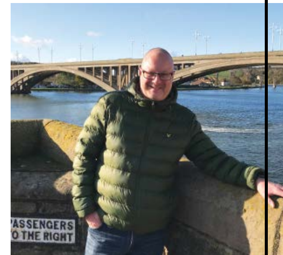
On route to the match

We don't take our seats in the stand as we don't want to miss any of the action, we stand on the cold grey shard stones which are now glistening in the afternoon sun.