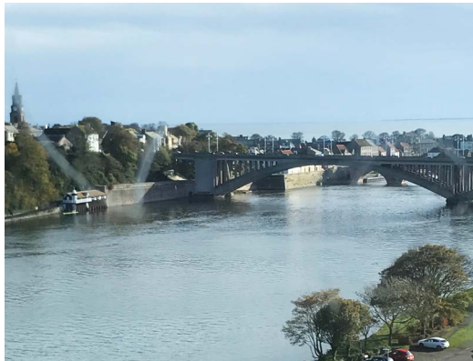
The up and coming Berwick-upon-Tweed

"Can we have a rewind" as Craig David once said, did someone mention Tunnocks Wafer Caramel Wafer bars?